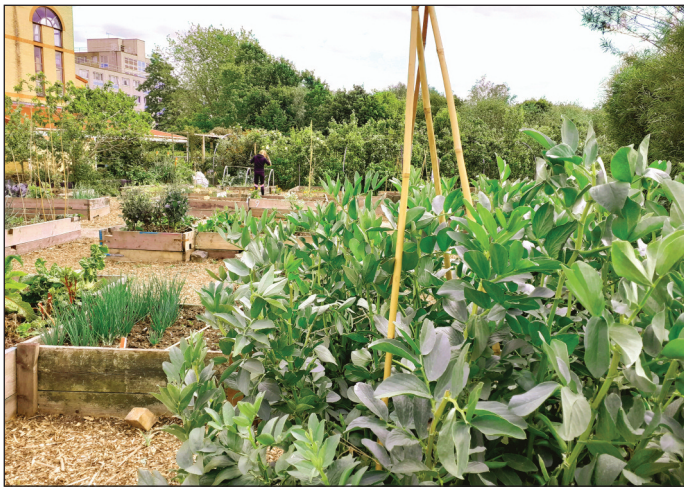
Left: Harmony Gardens flourishes

Covid pandemic and finding the work very therapeutic. A work day was organised to clear up the Children's Garden and a group is being sought to care for and use this area for after school clubs and other adult sessions. The group has obtained a grant to enable them to employ 3 people, an After-School Club leader, A Sunday Gardener and a general coordinator. A small amount will go towards demolishing the old shed and buying some plants and equipment. They have been donated a Cob oven so hope to hold some community cooking sessions.