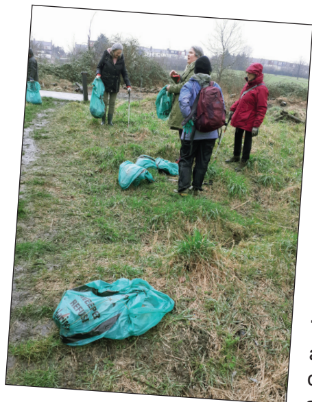
Above: Lordship Litterpickers

The Spinney. This area on the east side of the Rec has continued to be looked after and has been mapped for the Conservation Action Plan. TCV carried out three volunteer days to do dead hedging, tree coppicing, woodchipping of paths, and maintaining a glade.