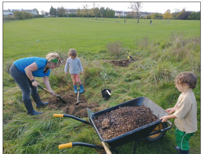
Above: Tree planting in the orchard

The Orchard group has had a good year and there are now a wide variety of fruit trees in the orchard field. There have been regular volunteer sessions. There were also several well-attended skill-sharing workshops for pruning and grafting, and also coppicing of the Hazel trees - the cut wood was used to make bean poles and protective cages for the fruit trees. During Covid our annual Apple Day and Wassail events could not happen but there was an online tree quiz and individual families decorated trees they had planted. A map of the orchard has been created showing where all 100 trees are and they are all numbered and named so people can identify the trees. 15 have been planted in the past year. The trees have been named and tended by local families.