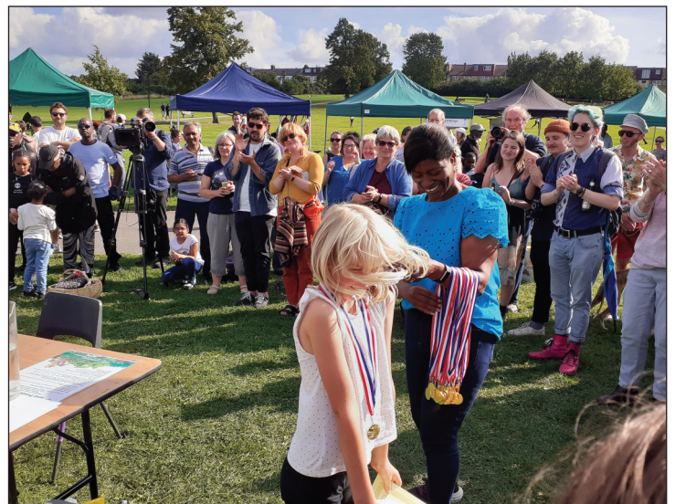
Above: A Flower Show winner gets an award

Lordship Hub The Hub has survived the covid pandemic lockdowns, closure and financial crisis – thanks to public support and donations, and over 50 volunteers. It is now fully operational again. The Friends, having led on the development of the Hub Co-operative in 2013, have continued to support various community events and activities there and run holiday art workshops for children. We continue to have a representative of the Friends on the Hub board.